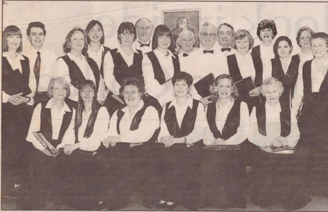
The Banchory Singers were just one of the choirs to thrill the audience at the Deeside Singing Festival at Aboyne Theatre at the weekend.